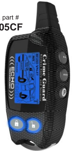
Omega part # #152-05CF