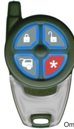
Omega part # #149-05

5th Channel - Press the Unlock and "III" buttons together.